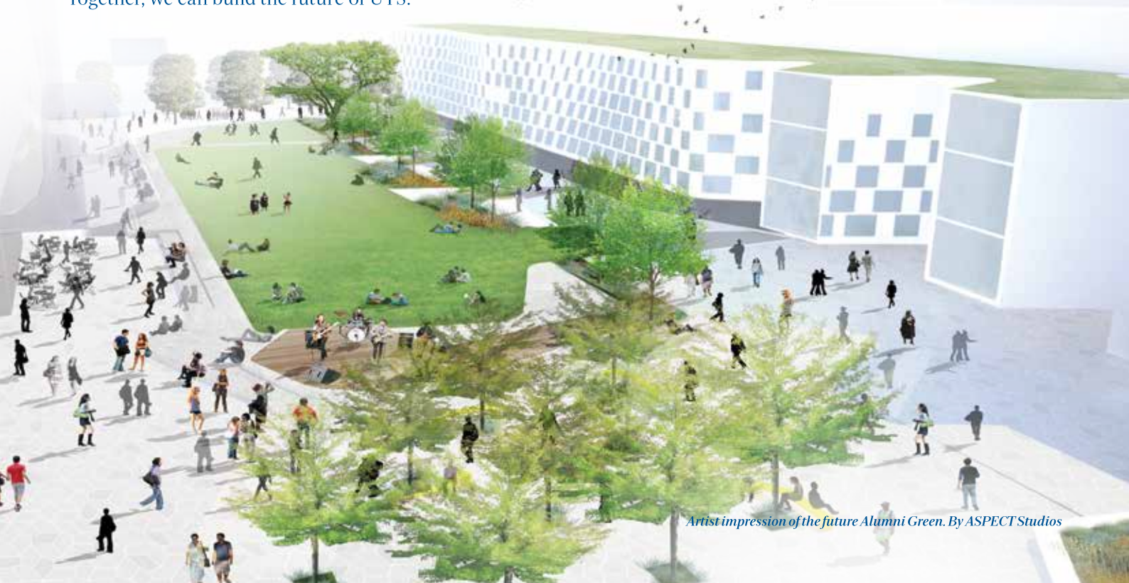
Artist impression of the future Alumni Green. By ASPECT Studios

Together, we can build the future of UTS.